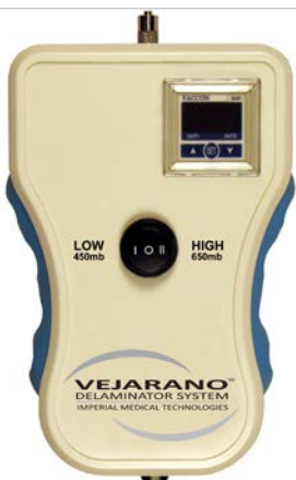
V Glide System™